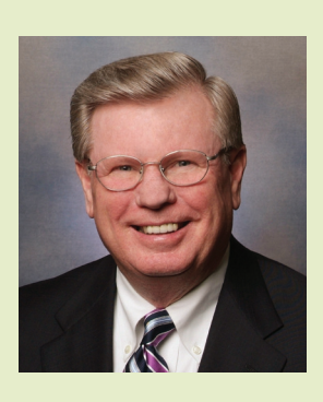
A Word from our Rastor. . .

Consider a Kingdom Legacy gift using services offered by your Eastern Hills Baptist Church Foundation.