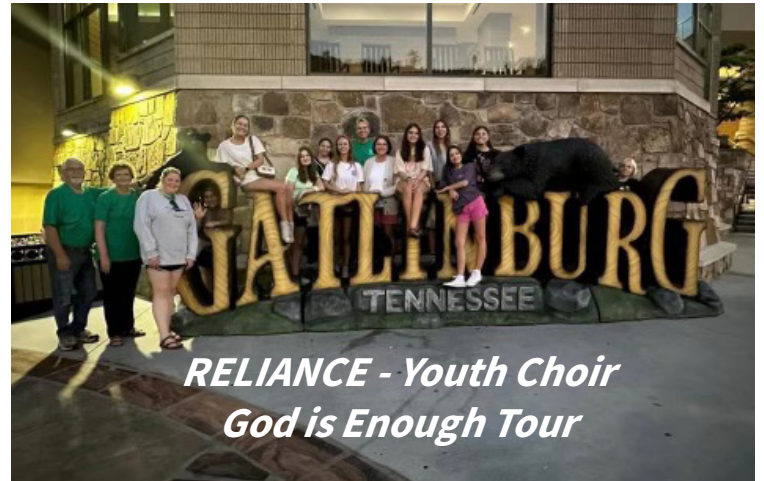
RELIANCE - Youth Choir God is Enough Tour