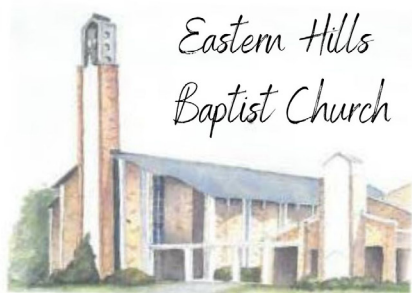
Eastern Hills Baptist Church

RSVP: Please call the church office at (334) 272-0604.