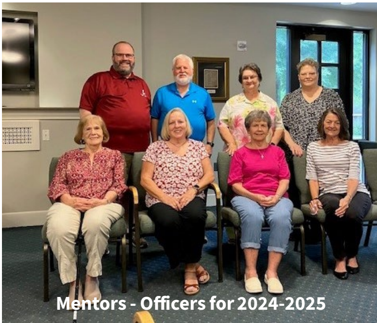
Mentors - Officers for 2024-2025

Monday, September 30, 8:00 AM - Senior Breakfast Bunch at Chappy's on Perry Hill Road