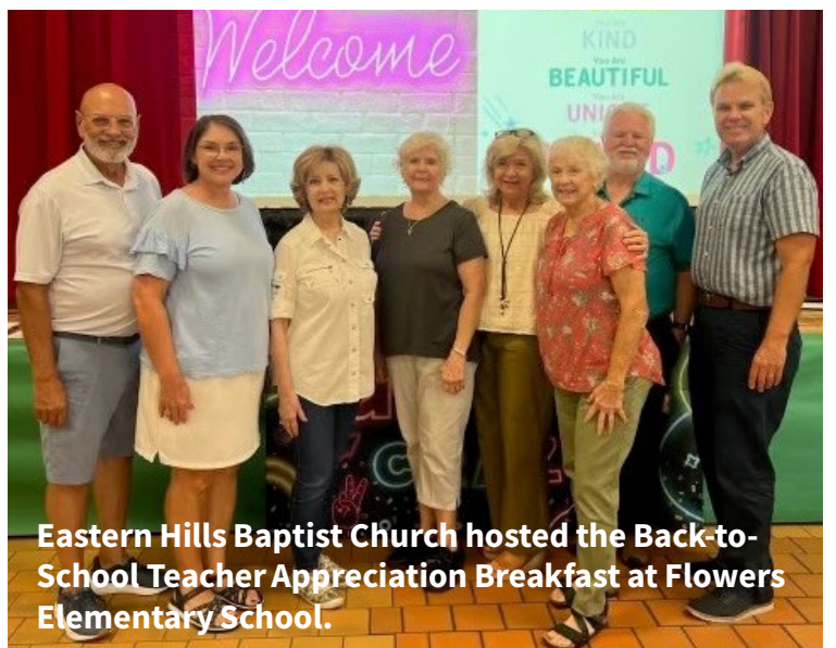
Eastern Hills Baptist Church hosted the Back-to-School Teacher Appreciation Breakfast at Flowers Elementary School.