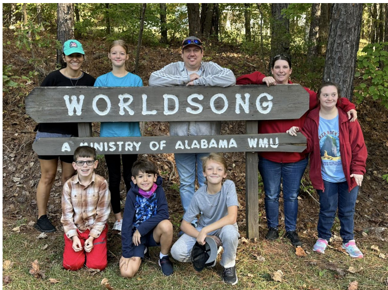
Fall Missions Festival for Children-Cook Springs, Alabama