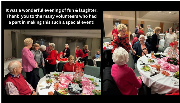
It was a wonderful evening of fun & laughter. Thank you to the many volunteers who had a part in making this such a special event!