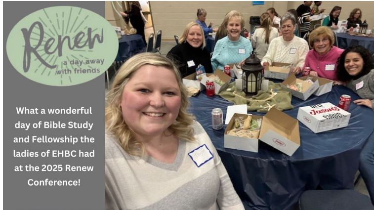
What a wonderful day of Bible Study and Fellowship the ladies of EHBC had at the 2025 Renew Conference!