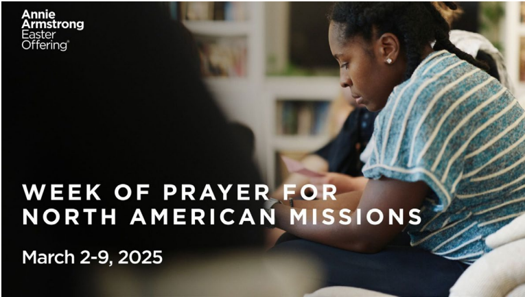
Annie Armstrong Easter Offering

WEEK OF PRAYER FOR NORTH AMERICAN MISSIONS