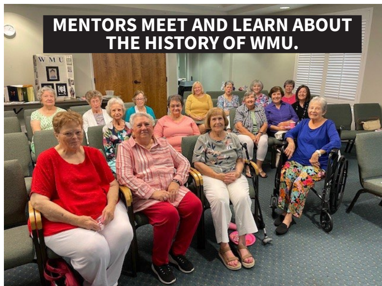
MENTORS MEET AND LEARN ABOUT THE HISTORY OF WMU.