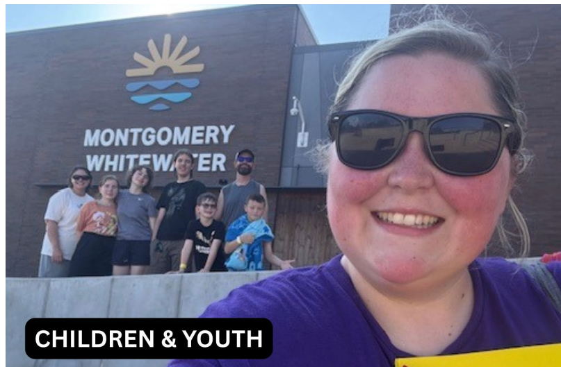
CHILDREN & YOUTH